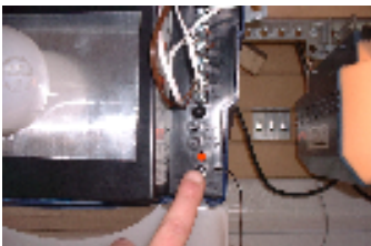
Learn Button location

With the remote in one hand, find the "LEARN BUTTON" with the other. The Learn Button is located next to a tiny red light. By pressing the learn button once, you will activate the light, which will now be blinking.