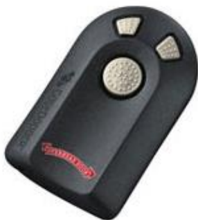
3 Button Remote: you may have a 1 or 2 button which looks similar.

Once the red light is blinking, press your remote button once...twice...and then for a third time. There should be about 1 second in between each press of the button. Your garage door will now open and close with the push of a button!!