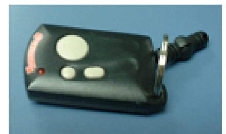
Also available in keychain style.