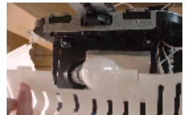
(2) pull cover down